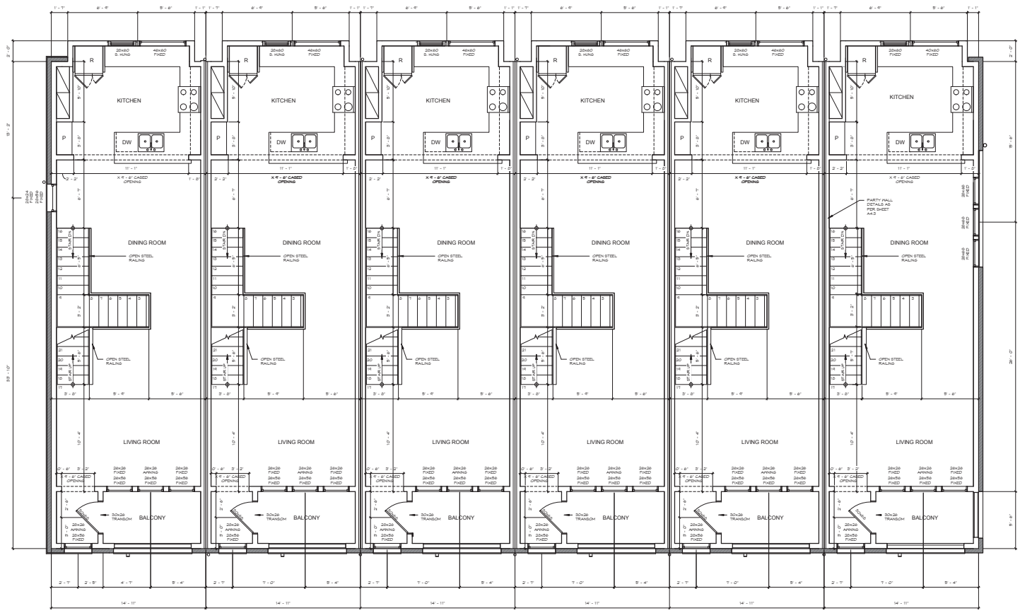
1 SECOND FLOOR PLAN 1/4" = 1'-0"